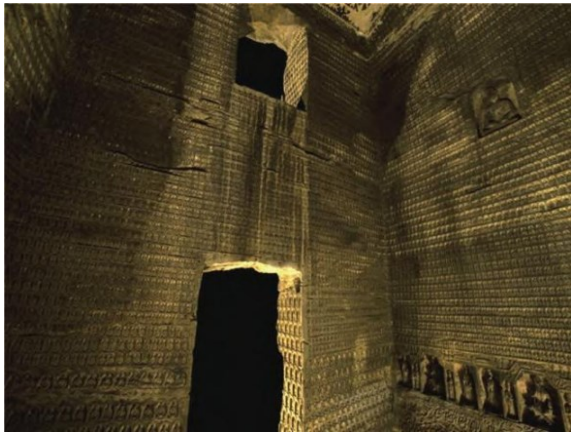
Figure 3. Interior of cave fifteen.

Give the viewer an impulse to bow down. There are thousands of buddhas carved on the upper floor of the east wall, and three pointed arches are juxtaposed on the lower floor. In the niches, there are sitting buddhas and sitting statues of two buddhas. Except for the door and the enlightened window, the south wall is a beautiful thousand Buddha statues.