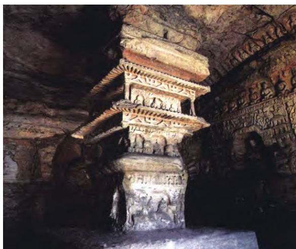
Figure 2. Central tower column of cave two.

niches on all sides, which not only permeates Indian culture and northern minority culture, but also has the characteristics of China traditional architecture. The upper four corners are hollowed out and carved with octagonal prisms, forming a circumferential cloister. The upper and middle floors of the tower columns are all in the form of typical wooden structures, and there are octagonal prisms at the four corners, which are extraordinarily rich in traditional cultural characteristics. The four walls of the cave are all layered with niches, and the top layer is carved with niches of the Tiangong Jile, and the Jile holds a series of traditional musical instruments (such as gain, pipa, and pixie). On the wall, a meditation belt, a large-scale niche, and a long scroll relief story are carved in turn, and the bottom layer is a portrait of a donor. The main statue on the north wall is Jiao Buddha. There are four niches in the west wall, and solemn and sacred pagodas are carved between the niches. There are thousands of buddhas on the east wall, and there are four niches juxtaposed below, and there are seats inside the niches [14].